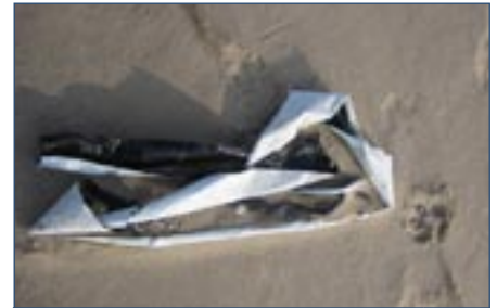
Plastic/polystyrene pieces > 50 cm 47

Unrecognisable pieces of plastic size 2,5 cm - 50 cm: number 46 on the survey form