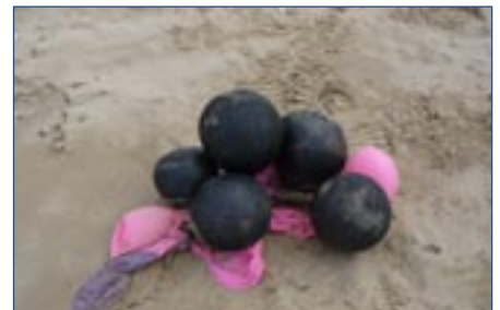
Balloons including plastic valves, ribbons, strings etc. 49

A string (with or without a piece of balloon attached) is counted as one balloon: number 49 on the survey form