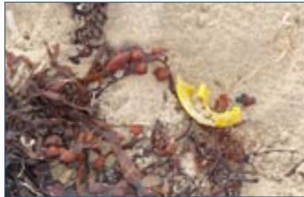
Plastic/polystyrene pieces 2,5 cm > < 50 cm 46

Unrecognisable pieces of plastic smaller than 2,5 cm: number 117 on the survey form