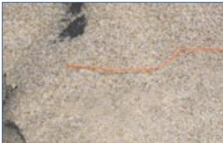
String and cord (diameter < 1 cm) 32

obviously part of this rope. However, all these pieces should be counted as single items.