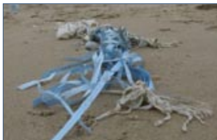
Balloons including plastic valves, ribbons, strings etc. 49

One valve (with or without a piece of balloon attached) is counted as one balloon: number 49 on the survey form