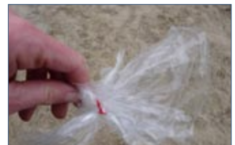
Small plastic bags, e.g., freezer bags

Piece of plastic bag recognisable as a shopping bag: number 2 on the survey form