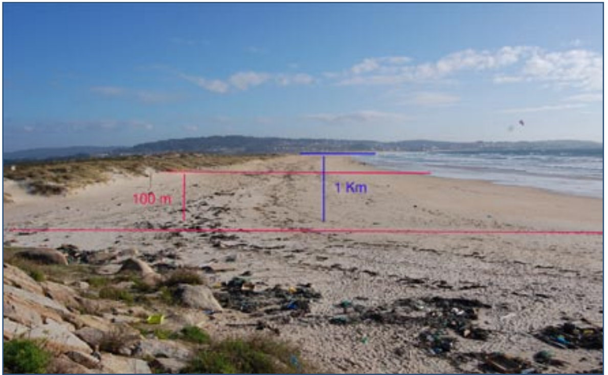
Survey from water edge to back of beach