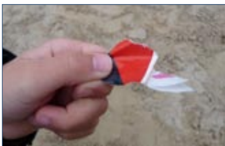
Plastic/polystyrene pieces < 2,5 cm