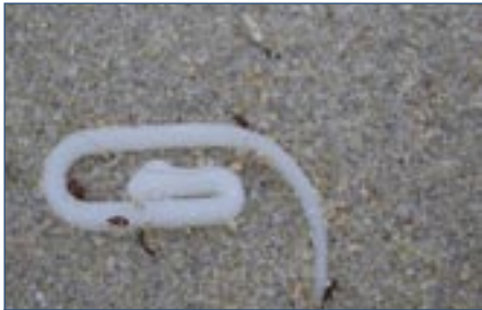
Plastic/polystyrene pieces < 2,5 cm 117

its size (number 117, 46 or number 47 on the survey form).