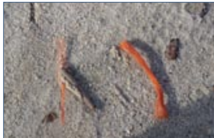
String and cord (diameter < 1 cm) 32

A piece of string, counted as such: 1 x number 32 on the survey form