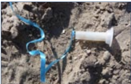
Balloons including plastic valves, ribbons, strings etc. 49

'balloon' (number 49 on the survey form).