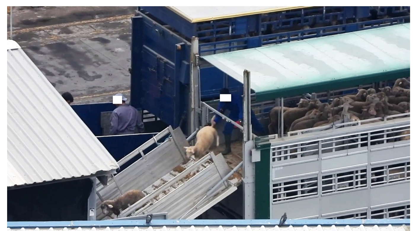
Figure 6. June 2021, sheep is lifted by the tail out of the truck for loading on the Omega Star at Cartagena Port (Spain).