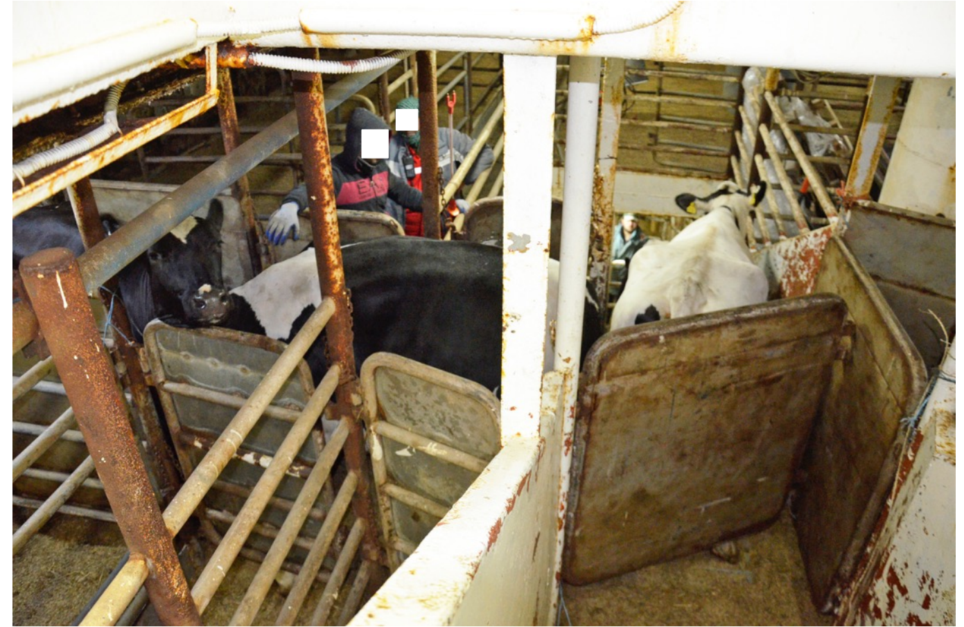
Figure 4. February 2017, German heifers are being loaded onto the Karim Allah at Rasa Port (Croatia). They have to proceed and turn around on a steep ramp.