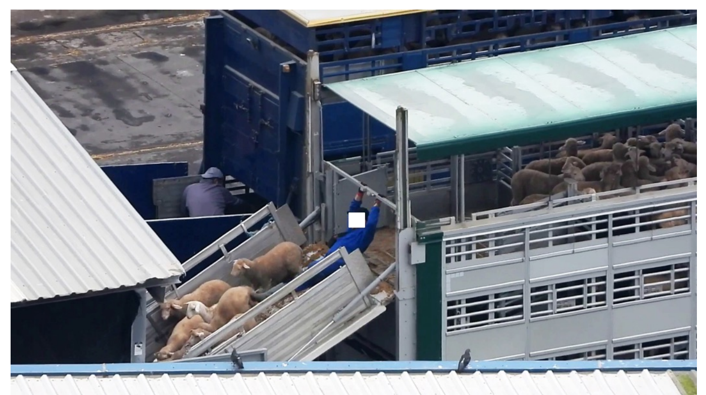
Figure 5. June 2021, sheep are kicked out of the truck for loading on the Omega Star at Cartagena Port (Spain).