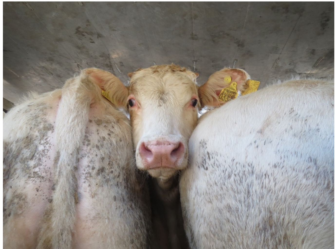
Figure 7. November 2014, Hungarian cattle packed in high density on Abou Karim II (renamed Nelore ) at Koper (Slovenia).