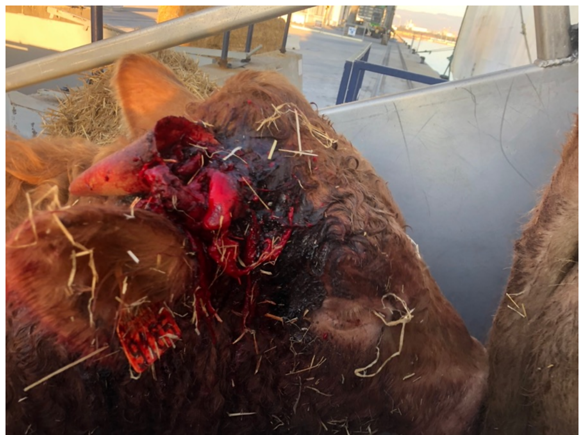
Figure 10. December 2021, cattle with a broken horn on board North Star 1 .