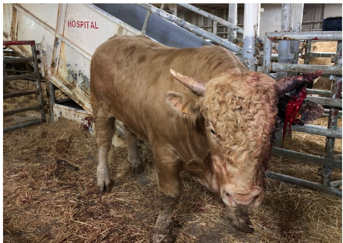
Figure 9. October 2021, a French bull with a broken horn is placed in a hospital pen on board the Nader-A .

64 EU-approved livestock carriers. Photo appendix