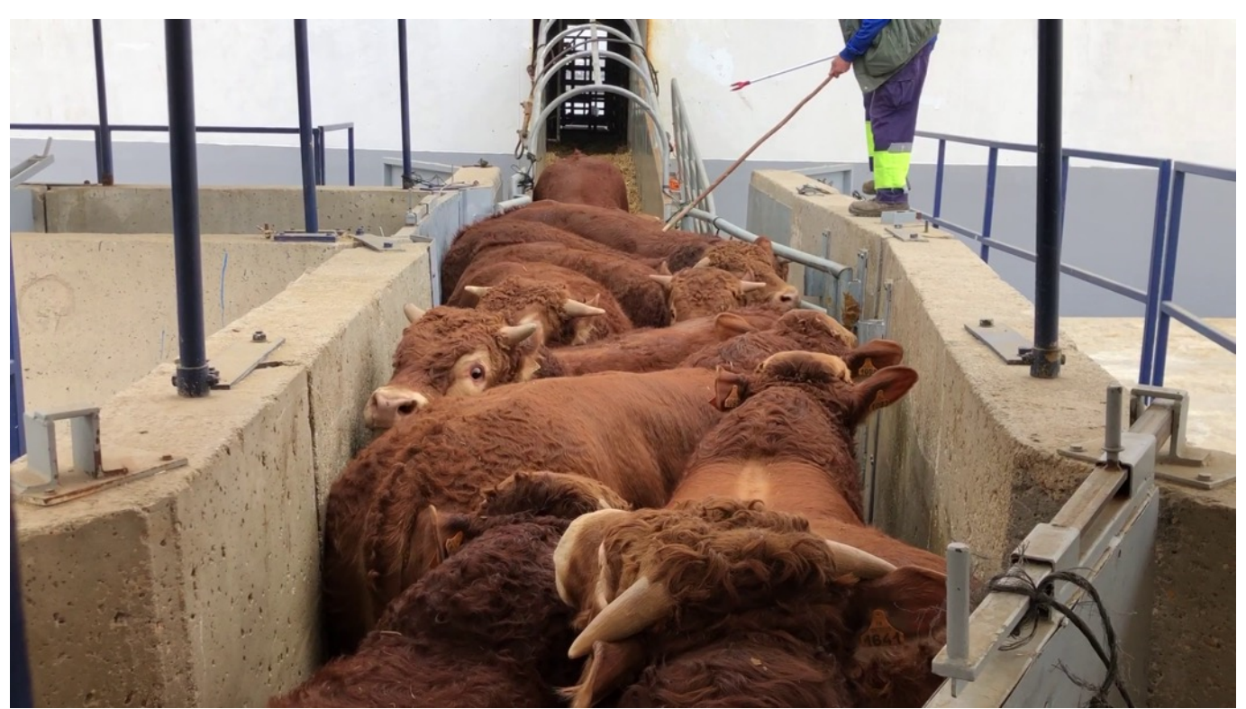
Figure 3. December 2021, Spanish bulls are being loaded on the Tulip.