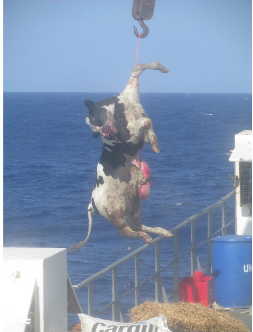
Figure 11. October 2016, the dead heifer is thrown into the sea from the Karim Allah.