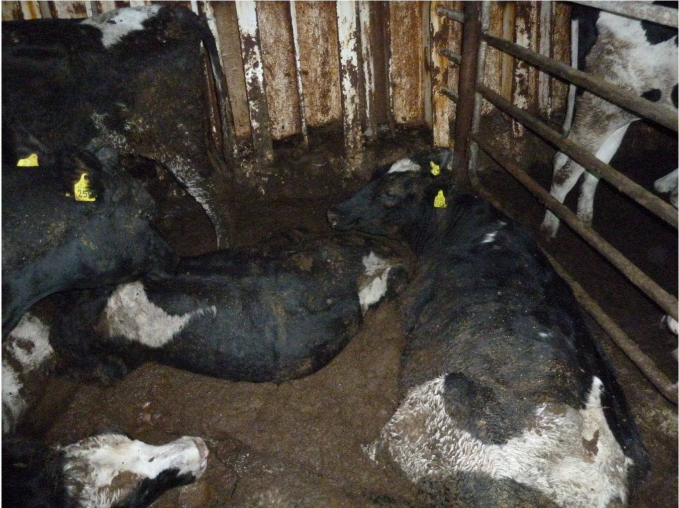
Figure 12. October 2016, animals covered with manure on the Karim Allah.