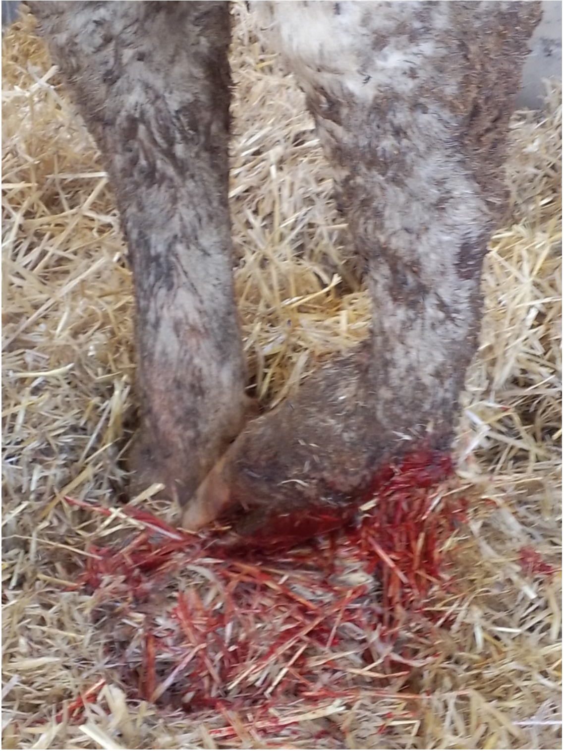
Figure 8. October 2021, cattle with a broken leg on board Karim Allah .