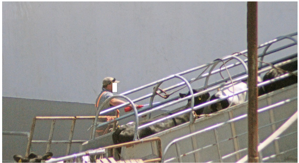
Figure 2. June 2021, cattle are being loaded on the Tulip at Rasa Port (Croatia).